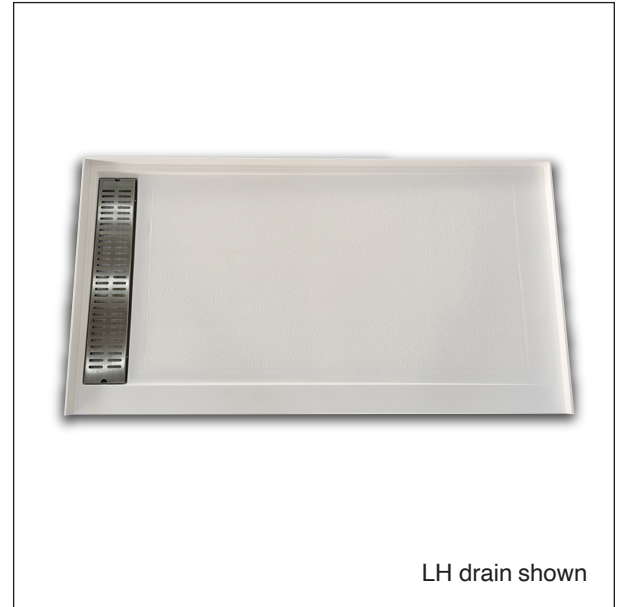
Heavy Duty Stainless Steel Drain Cover